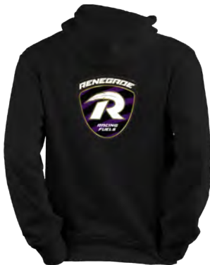
HOODIE // SMALL - 5X