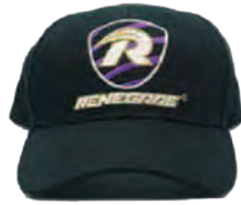
CURVED BILL HAT