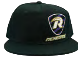
FLAT BILL HAT